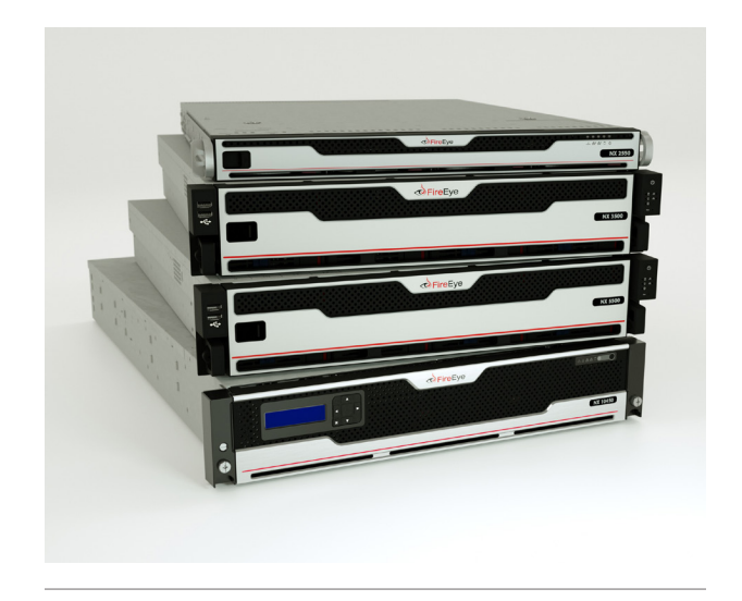
Figure 2. Examples of Integrated Network Security include NX 2550, NX 3500, NX 5500, NX 6500.